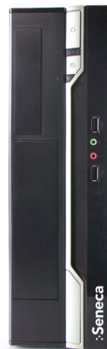
Small Form Factor