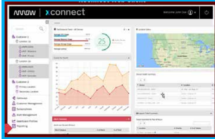
Real-time data to audit, manage and maintain security systems

Get email or push notifications about potential issues before hardware malfunctions happen.